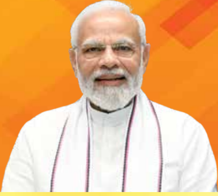
नरेंद्र मोदी प्रधानमंत्री