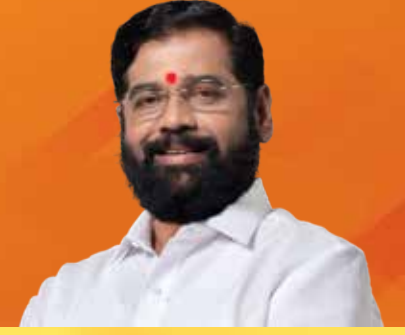
एकनाथ शिंदे मुख्यमंत्री