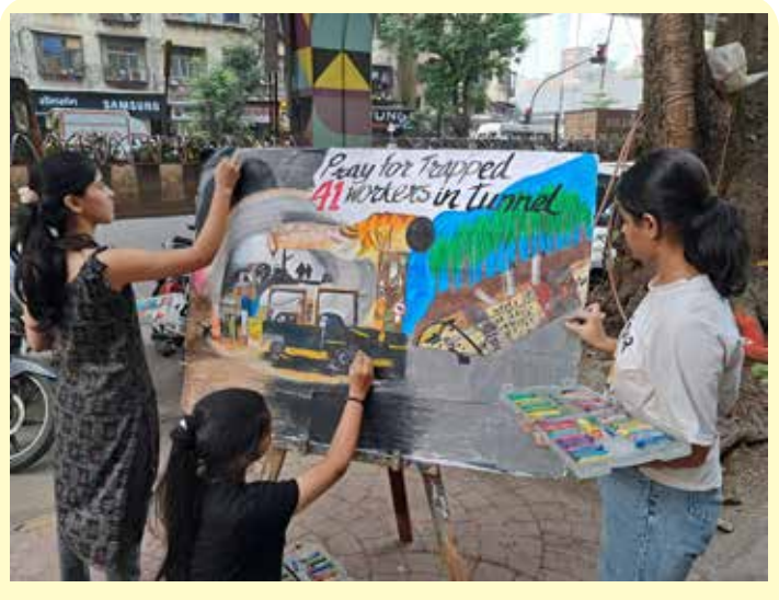
Gurukul students in Mumbai were seen offering prayers through their painting for 41 workers who are trapped at Silkyara tunnel due to sudden collapse in Uttarakhand while they were working.

to be established. "The woman has not been identified yet, but looking at her body, it is being estimated that her age could be between 25-35 years, the woman was wearing a T-shirt and track pants," they added. Moreover, police are also examining footage of CCTV cameras installed in the area. The case has been registered under Indian Penal Code (IPC) Section 302 (murder) and a search is on to track those who killed her, police added. More information is awaited. ANI