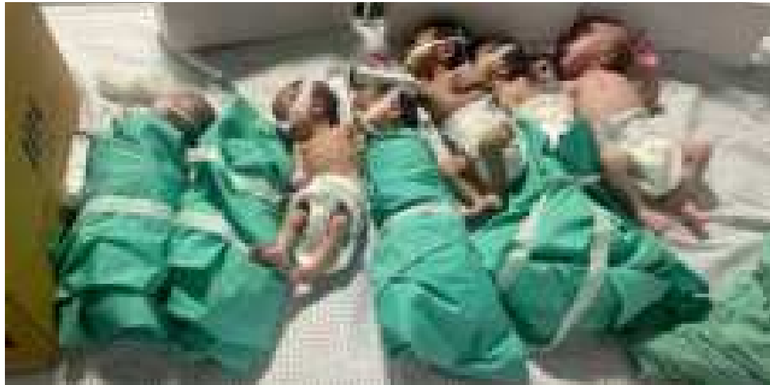
for the Eastern Mediterranean region, said that the agency was