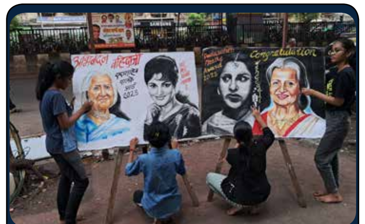
Gurukul students in Mumbai were seen congratulating legendary actor Waheeda Rehman who is all set to receive 'Dadasaheb Phalke Lifetime Achievement Award' through their paintings.