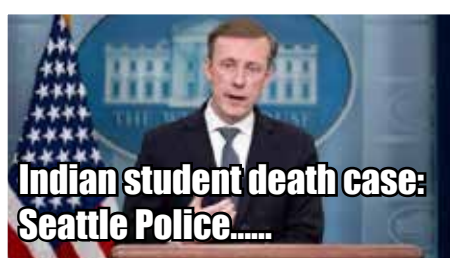
Indian student death case: Seattle Police.....