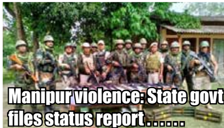
Manipur violence: State govt files status report.....