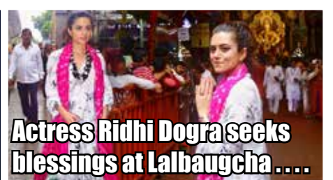
Actress Ridhi Dogra seeks blessings at Lalbaugcha.....