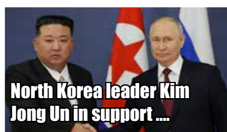
North Korea leader Kim Jong Un in support ....