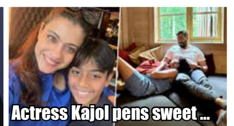
Actress Kajol pens sweet ...