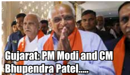
Gujarat: PM Modi and CM Bhupendra Patel.....