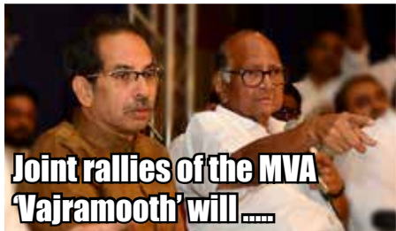
Joint rallies of the MVA 'Vajramooth' will.....