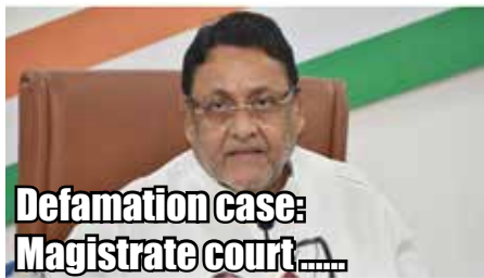
Defamation case: Magistrate court.....