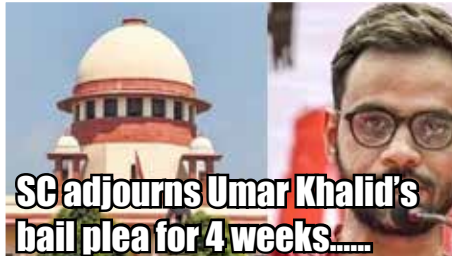
SC adjourns Umar Khalid's bail plea for 4 weeks.....