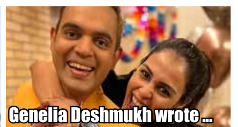
Genelia Deshmukh wrote...