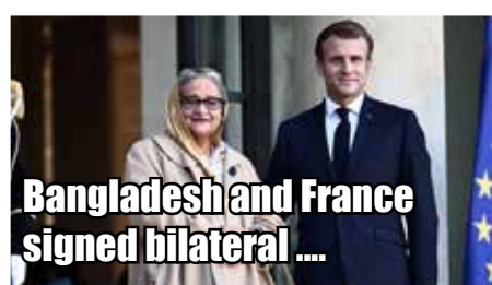
Bangladesh and France signed bilateral ....