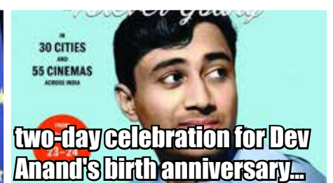
two-day celebration for Dev Anand's birth anniversary...