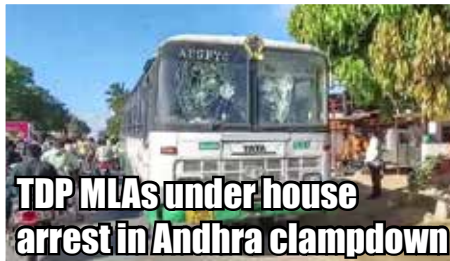
TDP MLAs under house arrest in Andhra clampdown