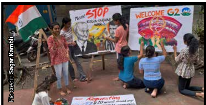
Students in Mumbai are spreading message of peace to "Stop Russia - Ukraine war" amid tensions seen between the two countries through their paintings while ongoing G20 Summit in Delhi.

The areca nuts in split form attract an effective Customs duty rate of 110 per cent of the value. Hence, the attempted duty evasion in this case by way of misdeclaration is around Rs 36 crore. Further investigation is underway, the official added. PTI