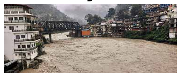
of Pindar, Additional Information

Tater levels of the Pindar river and its tributary Pranmati in Uttarakhand 's Chamoli district rose again on Wednesday following heavy rains, threatening to flood places located along their banks. . Both Pindar and Pranmati are in spate once again following which a flood-like situation has arisen in Tharali town located on the banks