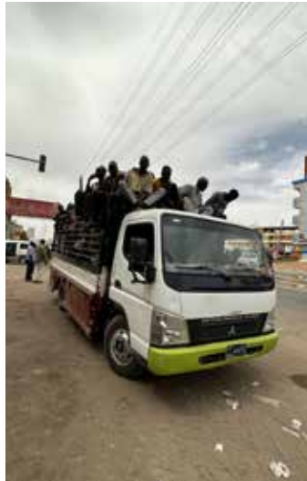
of clashes between the army and paramilitary forces.

"The two principals, General Abdel Fatah Al Burhan, the Chairman of the Sovereign Council and Commander in Chief of Sudan Armed Forces (SAF) and General Mohamed Hamdan Dagalo Leader of the Rapid Support Forces (RSF), have agreed in principle for a seven-day truce from May 4th to 11th. They also agreed to name their representatives to the talks," the statement read. In the telephone conversation, South Sudan's President stressed the importance of a longer ceasefire and naming of representatives to peace talks to be held at an agreed venue. This statement came as Sudan continues to face bloodshed as a result