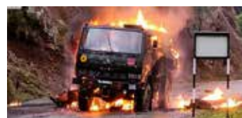
moving from Bhimber Gali to

According to the Defence PRO, "Today, at about 1500 hours, one vehicle of Indian Army, while