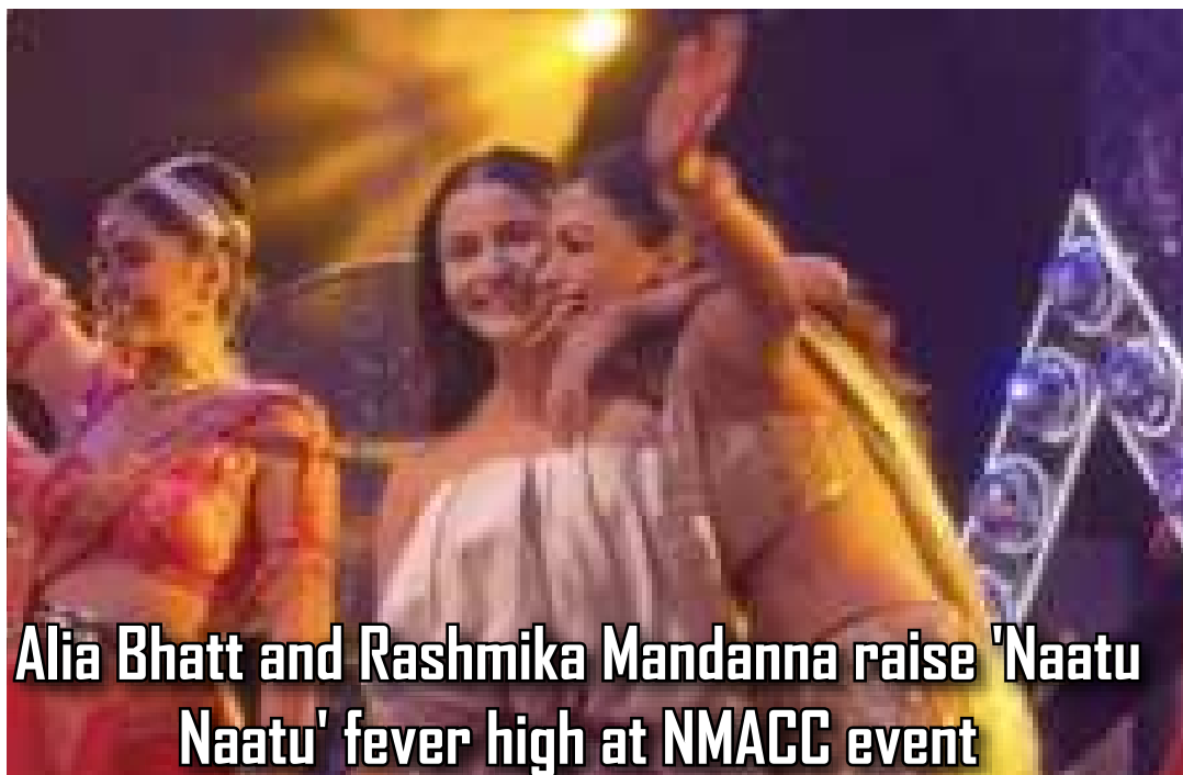
Alia Bhatt and Rashmika Mandanna raise 'Naatu Naatu' fever high at NMACC event