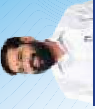
एकनाथ शिंदे मुख्यमंत्री