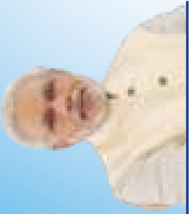
नरेंद्र मोदी प्रधानमंत्री

महा मुंबई मेट्रोने मिळाली जीवनाला गती, महाराष्ट्राची अभिनव प्रगती