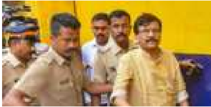
Shiv Sena leader on Wednesday. Meanwhile, ED officers

Raut, whose judicial custody was extended on September 5 by 14 days ended today, following which he was produced before the court. He was first sent to judicial custody on August 8. The court will hear the bail plea of the