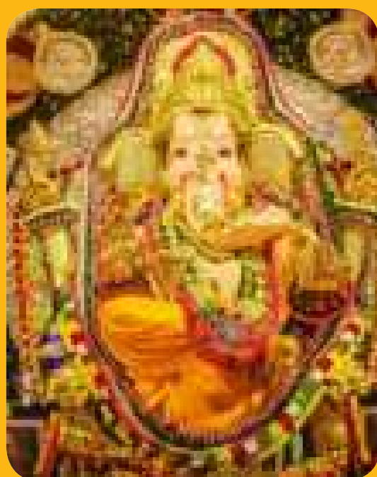
This year Mumbai's famous GSB Seva Mandal Lord Ganesh idol is adorned with 66 kg of gold and 295 kg of silver. Located in King's Circle, the GSB Seva Mandal idol is known as the richest Ganpati in Mumbai.