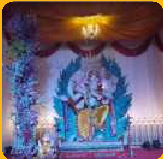
Upnagaracha Manacha Ganpati, at Rajendra Nagar in Borivali East area