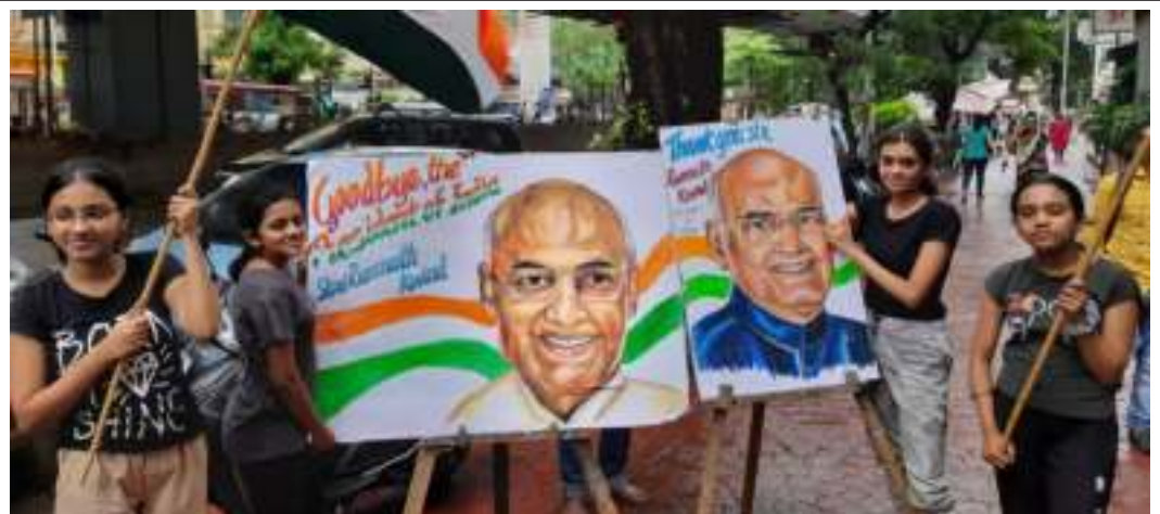
There is a new presidential election on July 18. The present President Ram Nath Kovind served as the President of the country for 5 years. The child artists of Gurukul wished by drawing a picture.

world. There have been many meetings of this group with the PFI. China has donated crores of Rupees to the PFI. It has been revealed during the investigations conducted by the Enforcement Directorate (ED) that Camps Front of India (CFI), a sister organisation of PFI and other such organisations have received Rs. 100 crores. PFI has