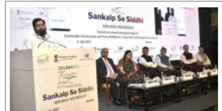
Samrudhi Highway will witness the development of Maharashtra says Chief Minister Eknath Shinde

"I challenge them to hold assembly elections today. If we have done wrong, people will send us home. And if this is what you had to do, then you should have done it two and half years ago, and it would have been done respectfully. There would be no need for all this to happen," Mr Thackeray said.