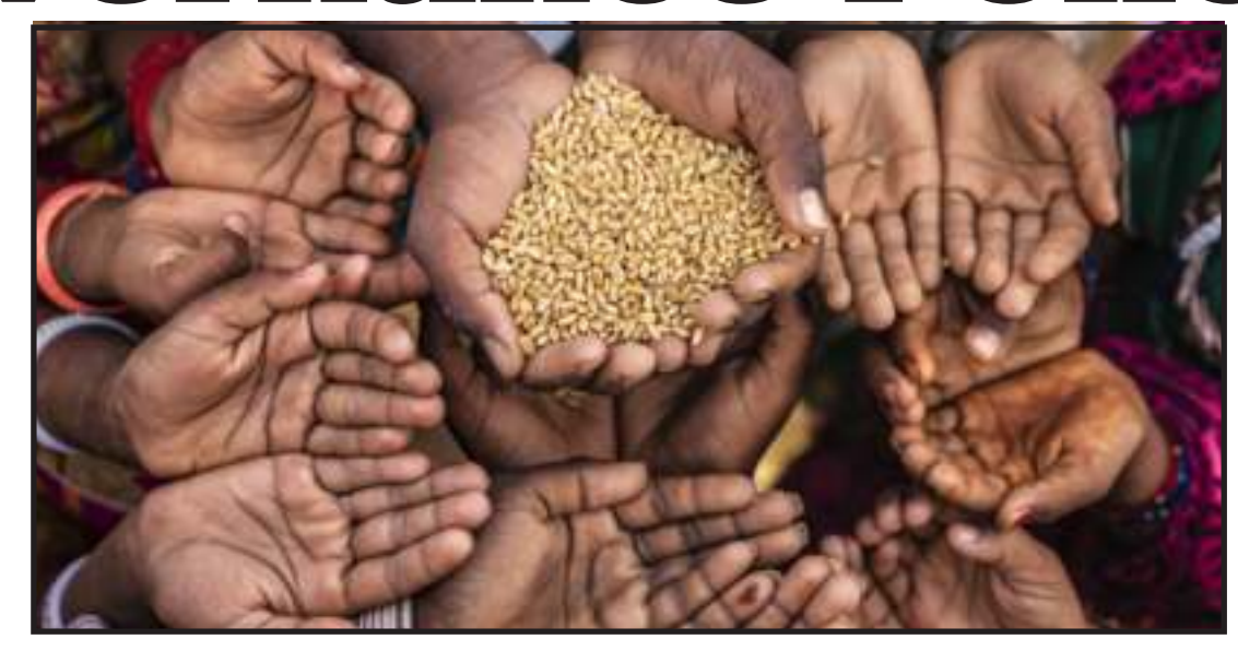
How much the measures adopted in order to cope with the corona epidemic helped in the prevention of the spread of the virus, is yet to be assessed, but as to its practical effect, if people are faced with a crisis of filling their stomachs, then why this condition persists, we need to think again.

In the latest report of the United Nations, even though